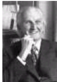
KEN BOULDING 1910-1994