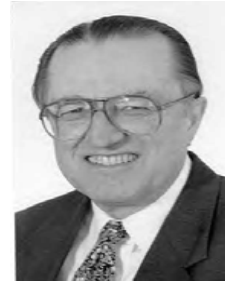
ANTHONY DOWNS 1930-*****