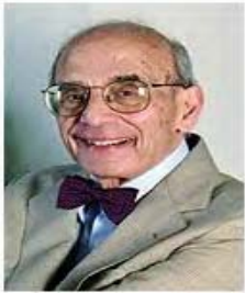
CHRIS ARGYRIS *****_*****