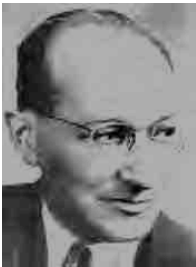
KURT LEWIN 1890-1847